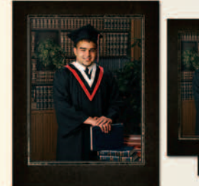
4 wallets FREE! ($24 Value)