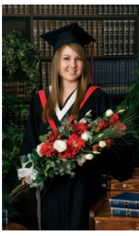
Call 492-0049 to book your time!